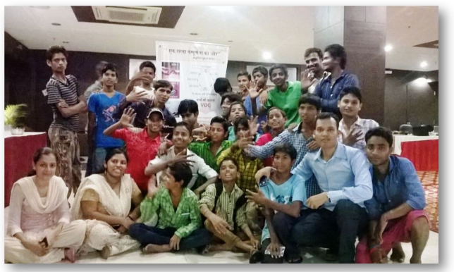
Children, ready to live the 'Rights-Way'

VOC 5 centres around a Rights based approach, which in turn is a Skill based approach. Some of the skills taught to the participants during the sessions are Win-Win, Proactive-Assertive behavior, Non-Violent Communication, etc.