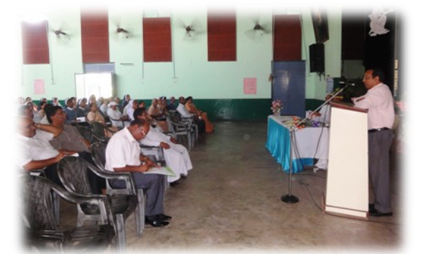
Participants clarifying the concept of 'Educate and Evangelize'

If education is understood as drawing out, and developing the various intelligences implanted in the young (according to the 'Multiple Intelligence Theory') by God, why do we hesitate to draw out or bring forth the best in every person – the 'Good News'. Becoming aware of the 'Good News' in each one of us, irrespective of any religion, and living the 'Good News' and sharing the experience of the same is Evangelization.