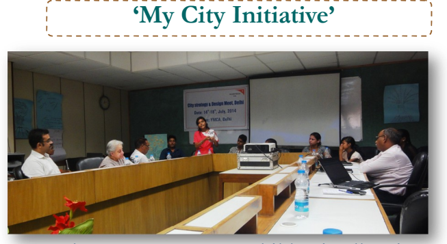
'Together we can create a Child-Friendly City'

Program: My City Initiative Date: July 15, 2014 Participants: NGO Leaders with World Vision